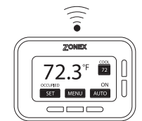
T-3 WIRELESS THERMOSTAT