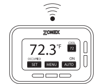
T-1 WIRELESS THERMOSTAT

DAISY CHAIN 24VAC AND 3 WIRE COMMUNICATION LINK TO ALL ZONE DAMPER BOARDS - EXPANDABLE TO 20 ZONES