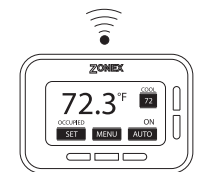
T-2 WIRELESS THERMOSTAT